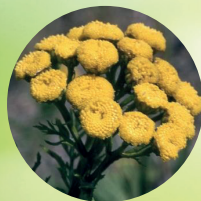
Tansy (Tanacetum vulgare)