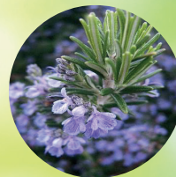
Rosemary (Rosmarinus officinalis)