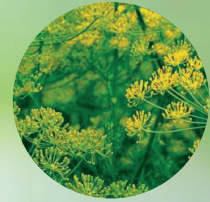
Dill (Anethum graveolens)