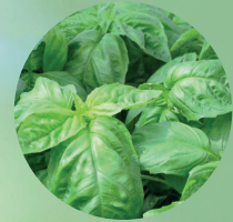
Basil (Ocimum basilicum)