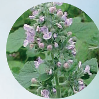
Catnip (Nepeta cataria)