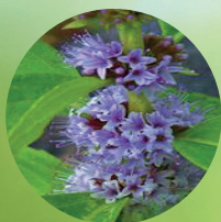
Mint (Mentha arvensis)