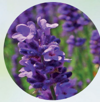
Lavender (Lavandula angustifolia)