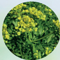
Rue (Ruta graveolens)