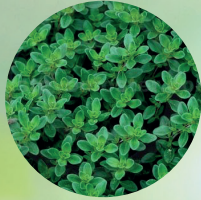
Thyme (Thymus vulgaris)